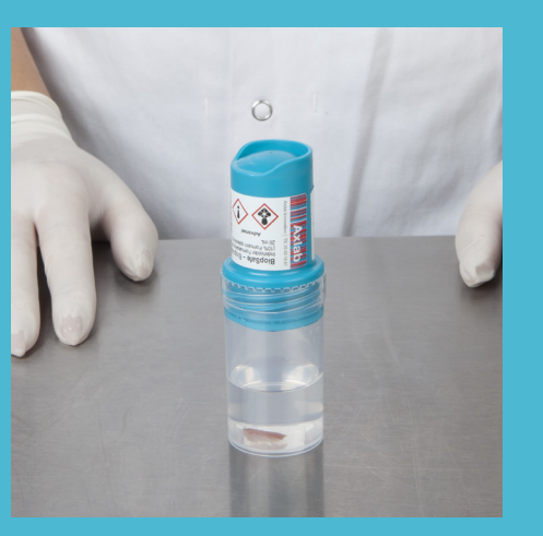
The biopsy is ready for transportation.