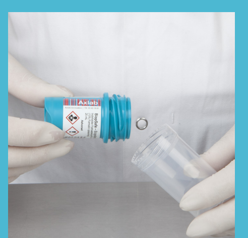
The lid is screwed of.

With BiopSafe there are no difficult formalin bags and wall holders that often leads to formalin waste. The system consists of a small, easy to use container (vial) with formalin capsuled in the lid. When the biopsy is placed at the bottom of the container, you screw the lid on and gently apply pressure with your thumb, allowing the formalin to flow out and cover the biopsy. Everything is done inside the container and no formalin is released in either liquid or vapor form.