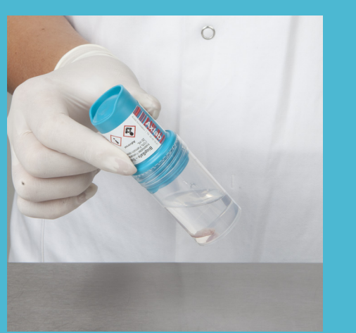
The formalin and the biopsy is mixed.