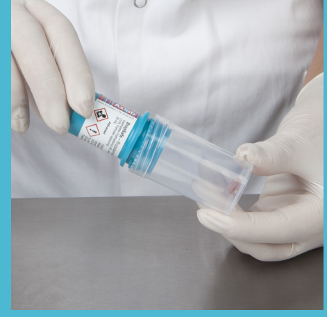
The lid is screwed on.