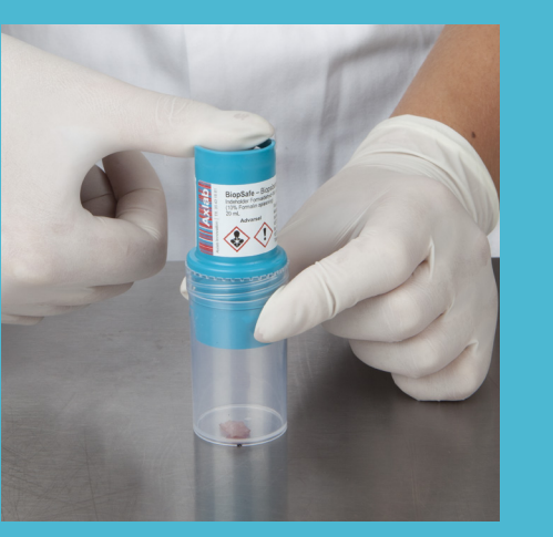
The formalin is released with a press of the thumb.