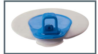
A = 4 mm fitting