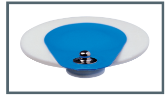
S = Stud