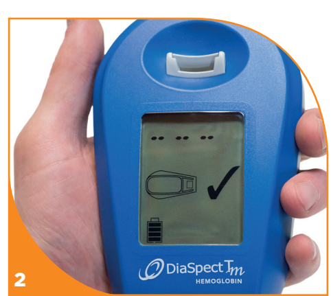
Ensure analyzer is ready for use