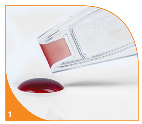
Collect blood sample