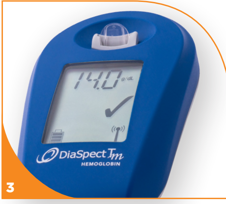
Results appear in 1 - 2 seconds