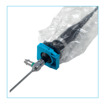
02 Attach the endoscope

Any excess drape is retained inside the ring.