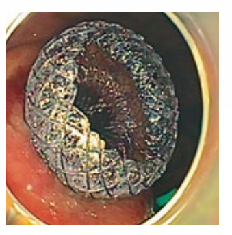
Transgastric access from stomach into pseudocyst