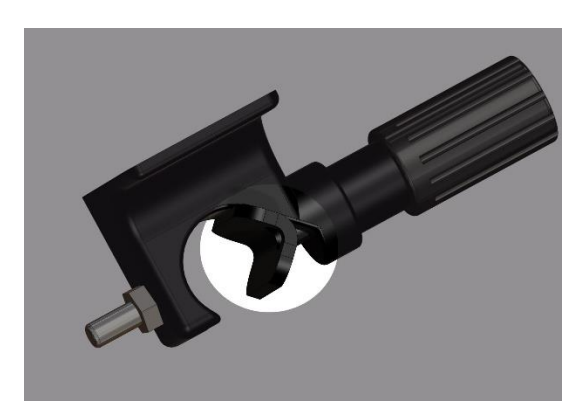
FAP3000153S (the aluminum piece circled)

To mount a pump, you need detail FAP3000153S, which is a protective aluminum plate to avoid damages to the stand tube.